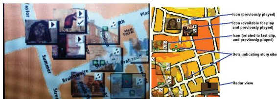
Fig. 5. The iPAQ user interface to the MPL.

Viewers were able to follow particular story threads by selecting (through a simple dialog box) the types of relationships they were interested in: themes, periods or characters. Whenever a clip was viewed, all clips related to it (by the selected types of relationship) were discretely marked on the map. At this time, a user was not able to watch these related clips, instead simply to determine where they had to go in order to do so. For example, if a user was interested in following characters, after watching a clip they would be shown all other locations where they could find out more about characters they had just seen. As the MPL stories were richly and multiply linked, this mechanism supported a wide range of viewer paths through the content.