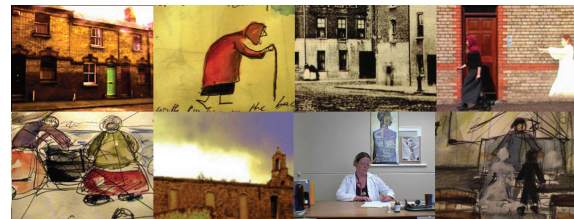
Fig. 1. Selections of frames the MPL audiovisual stories.

of video, animation and photographic media was combined with a first person voice-over elaborating on these images. A selection of frames from the audiovisual clips is shown in Figure 1. This conversational narrative style matched that adopted in Johnston's book. During meetings with the local community, numerous residents contributed their photographs, anecdotes and other media. This material contributed greatly to the production of atmospheric and realistic content. A collage of old images produced by the Liberties residents themselves during the research phase is shown in Figure 2. The project also benefited from the relatively undeveloped nature of the neighbourhood: good sets were easy to find. Furthermore, residents were eager to volunteer as actors or extras during filming. Figure 3 shows images from the MPL production phases.