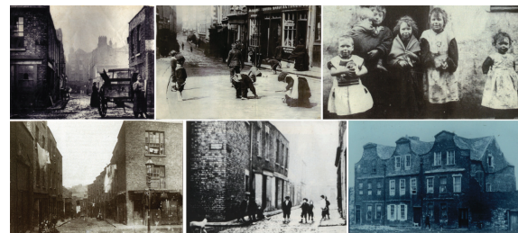
Fig. 2. Collage of old pictures provided by community members of the liberties during the research phase of the project.