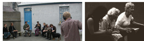
Fig. 3. Location shooting during the MPL project.