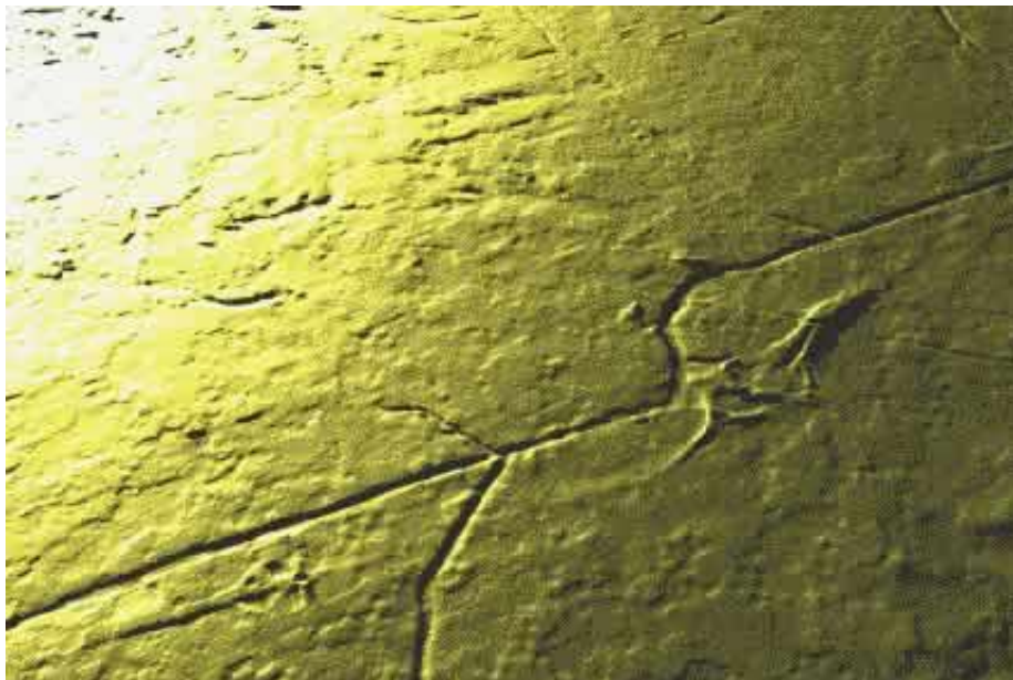
Evidence of the cultural in landscape data, Memphis, TN.